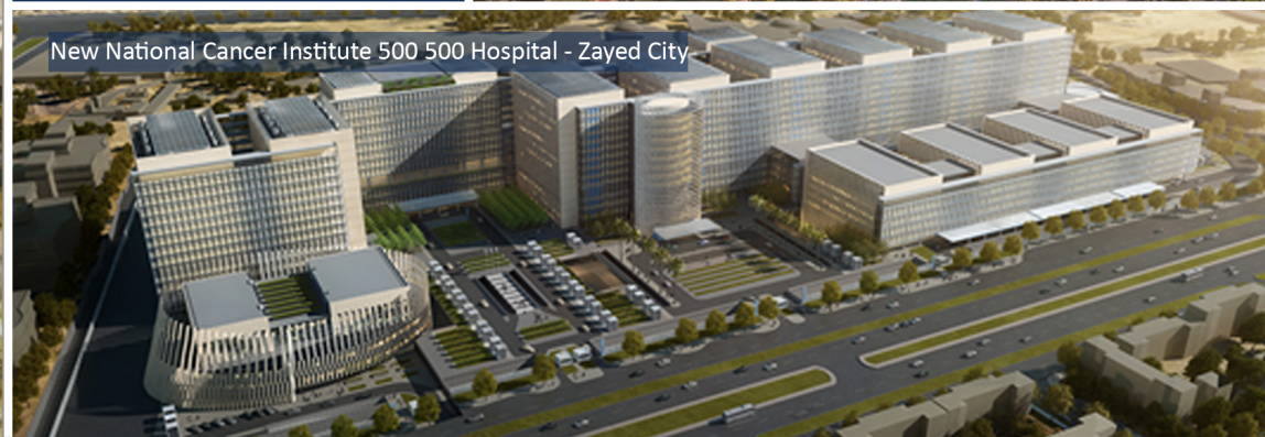
New National Cancer Institute 500 500 Hospital - Zayed City