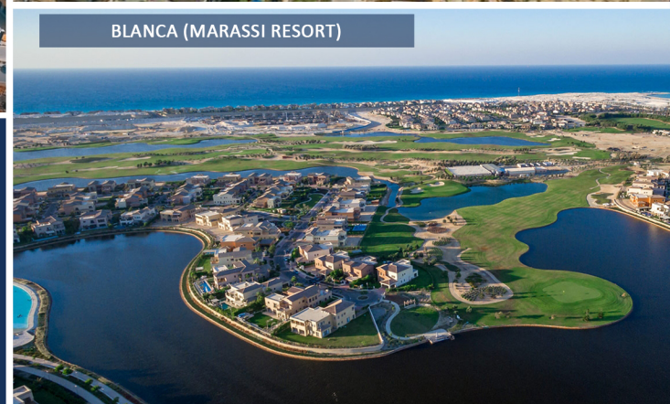
BLANCA (MARASSI RESORT)