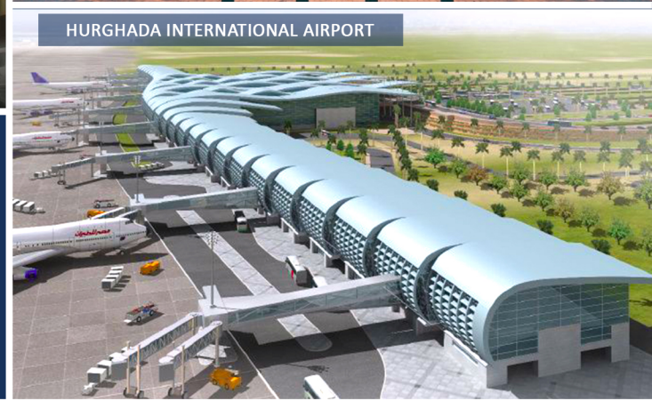
HURGHADA INTERNATIONAL AIRPORT