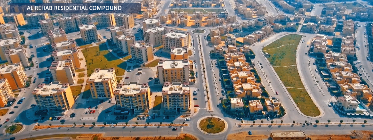
AL REHAB RESIDENTIAL COMPOUND