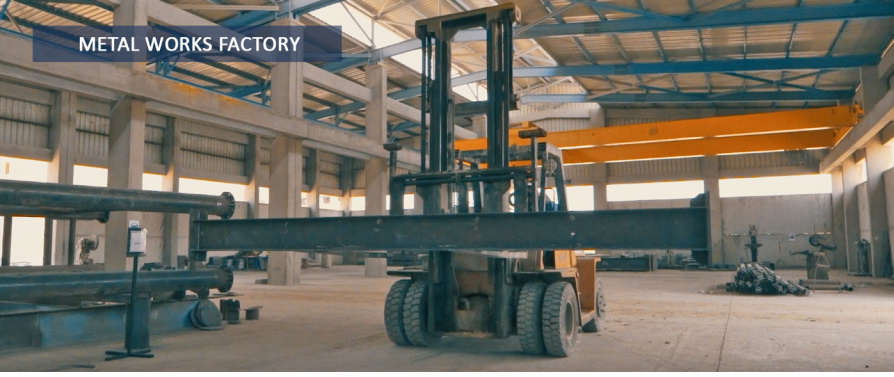
METAL WORKS FACTORY