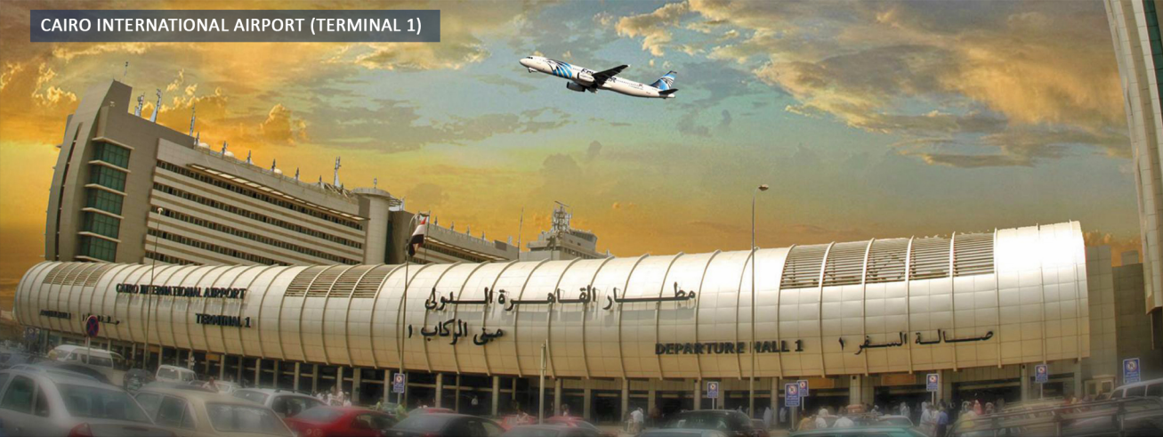
CAIRO INTERNATIONAL AIRPORT (TERMINAL 1)