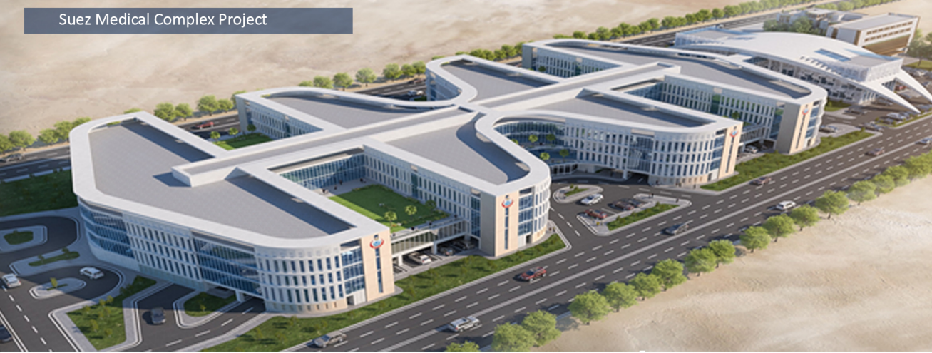
Suez Medical Complex Project